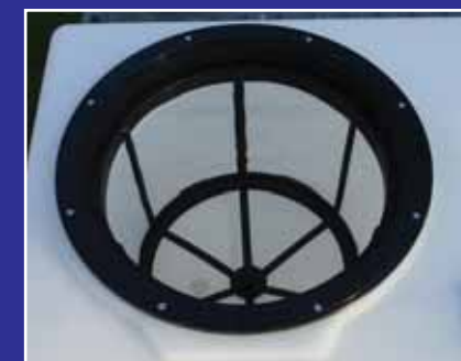
LARGE FILLING APERTURE WITH STRAINER