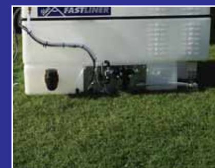
INTEGRAL WATER FLUSH TANK