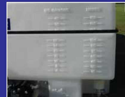
40 GALLON CALIBRATED TANK