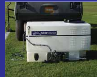
QUICK MOUNT SYSTEM

Combining high speed marking with quality engineering and unique patented features plus the ability to be removed quickly from the host vehicle making this an extremely versatile option.