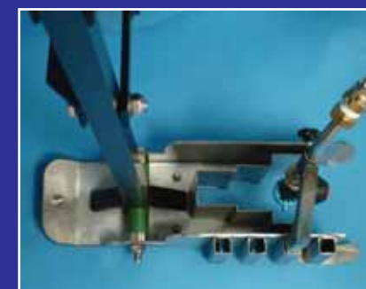
QUICK AND EASY LINE WIDTH ADJUSTMENT