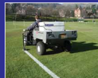
SUPERIOR LINE DEFINITION