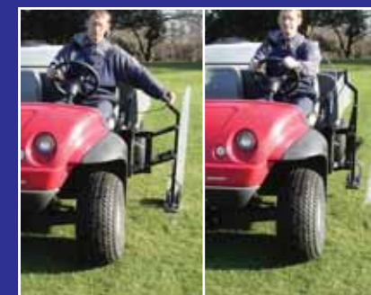
PATENTED RETRACTING ARM